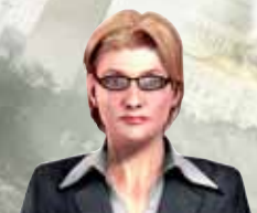
President Patricia Caldwell

Businessman Lucius Galliard has a successful, diversified portfolio. He also has powerful friends – friends who have made him the point man in an explosive operation that threatens to shake the foundations of Washington. With private military company Black Arrow following his orders, Galliard is a man to be reckoned with.